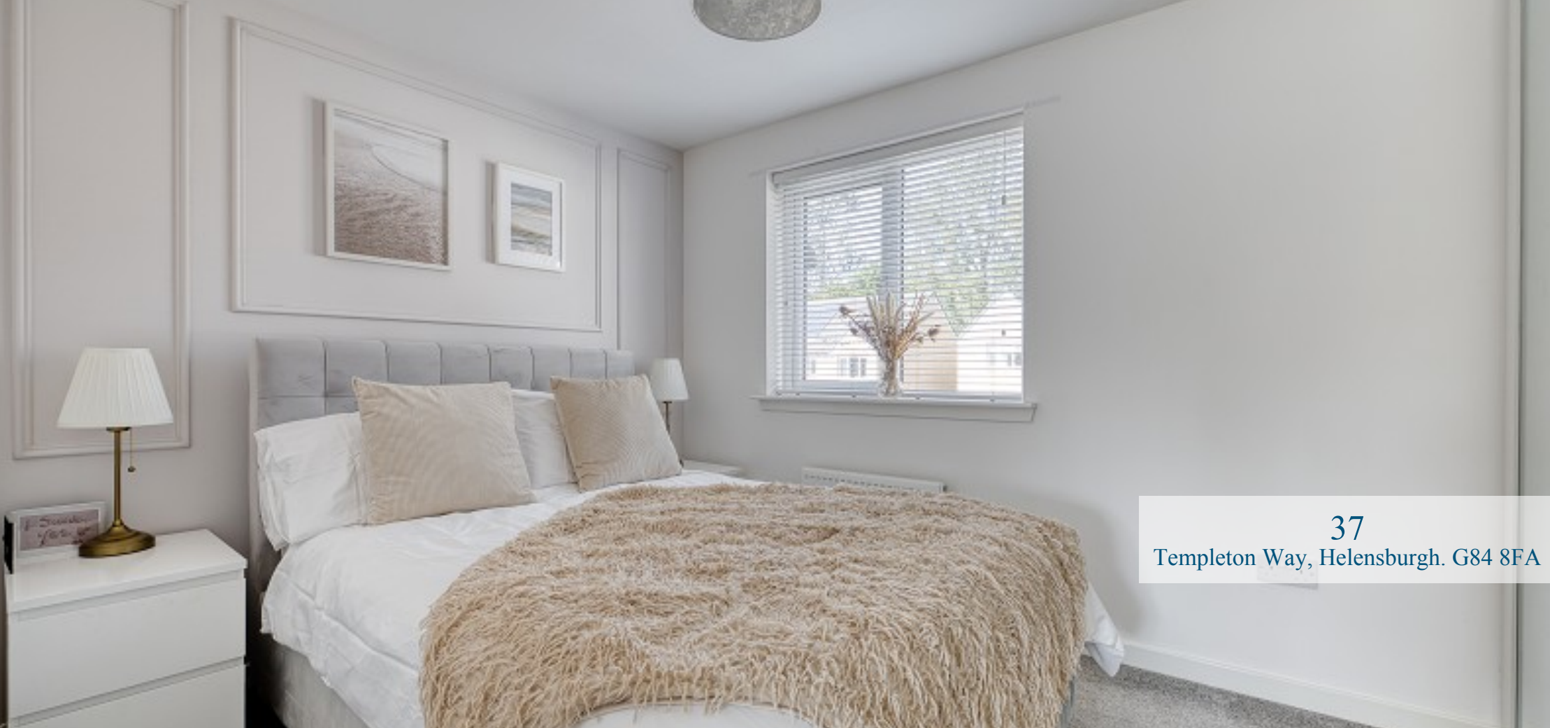
37 Templeton Way, Helensburgh. G84 8FA