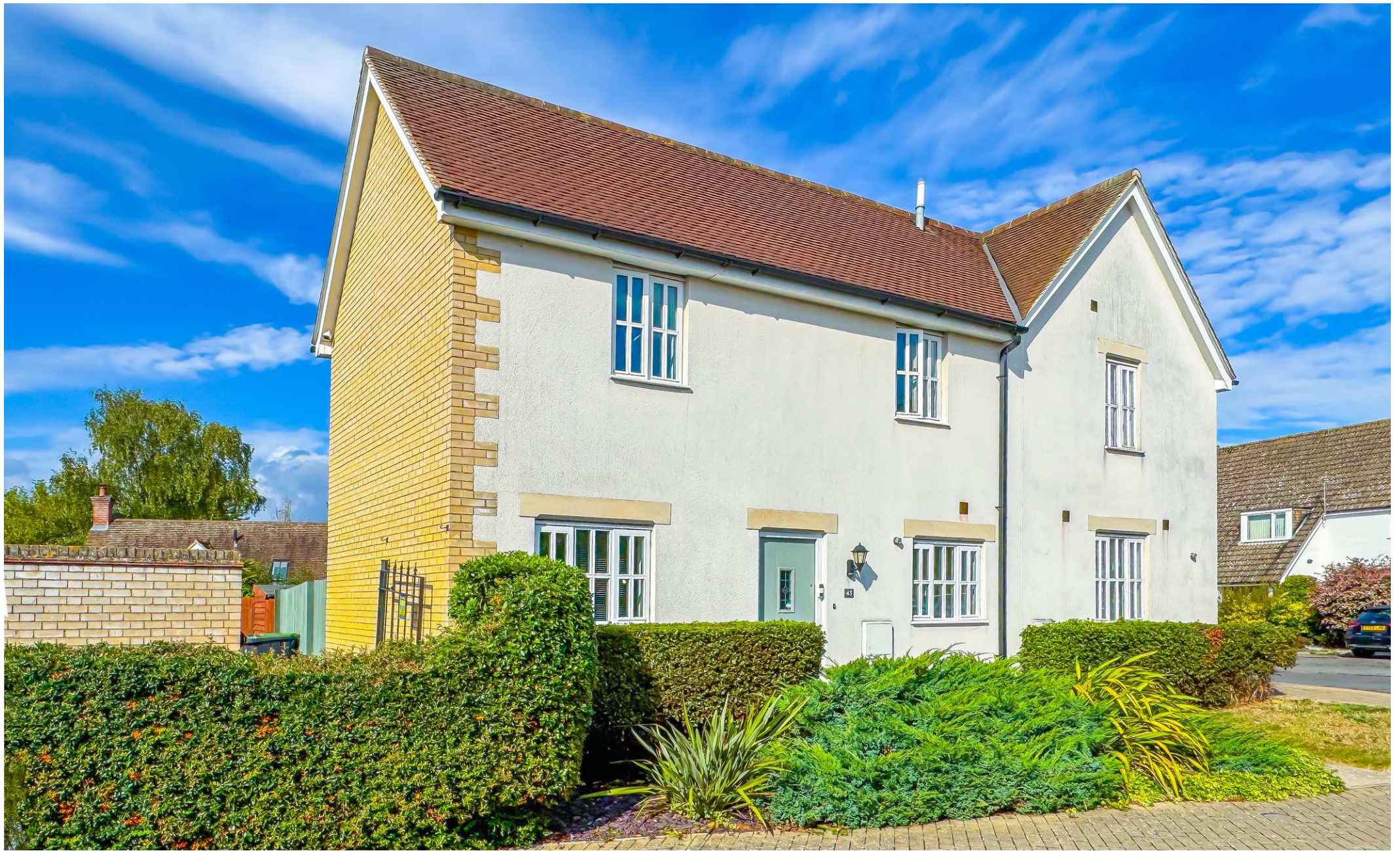
Myrtle Drive, Burwell, Cambridgeshire