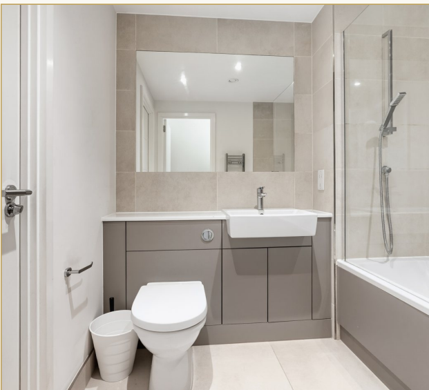
Main bathroom with bath