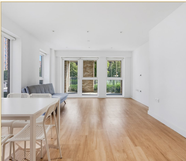
Open-plan living and dining area

A full range of integrated appliances, sleek handleless cabinetry and a contemporary tiled splashback feature in the kitchen, while engineered wood flooring runs through the living area. Both bedrooms are well-proportioned and benefit from fitted wardrobes, served by two contemporary bath/shower rooms, with a separate utility room.