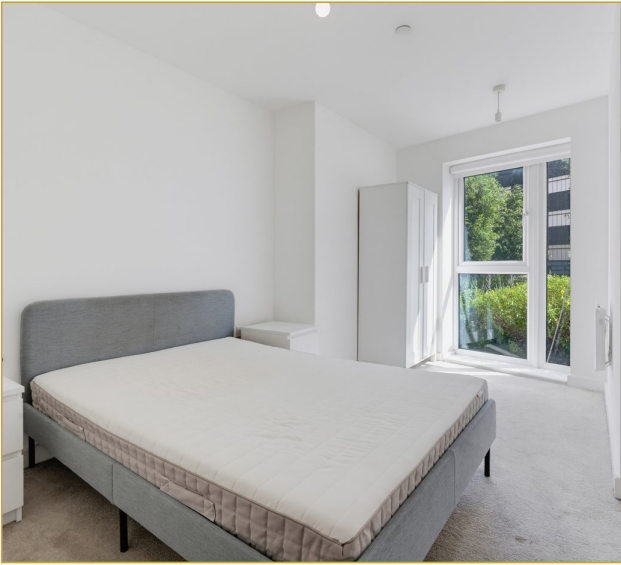
Principal bedroom with fitted wardrobe

A selection of interior views from across the apartment.