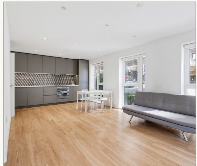
Kitchen with integrated appliances