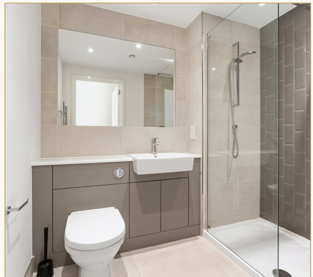
Separate shower room