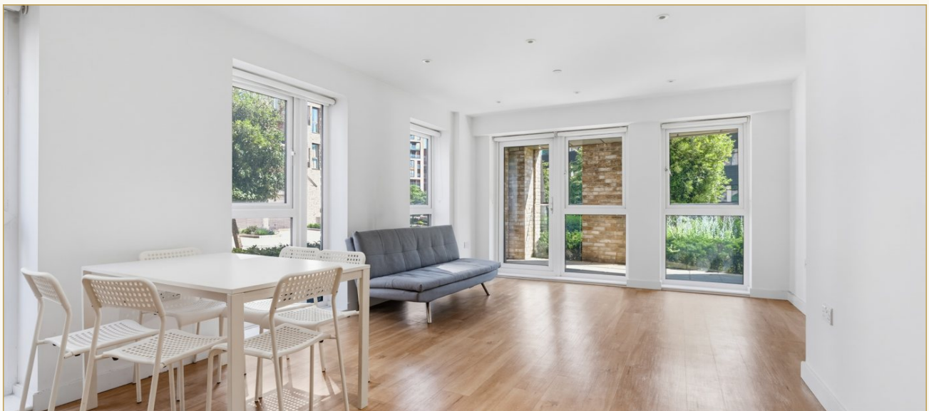
Living area opening onto the private balcony