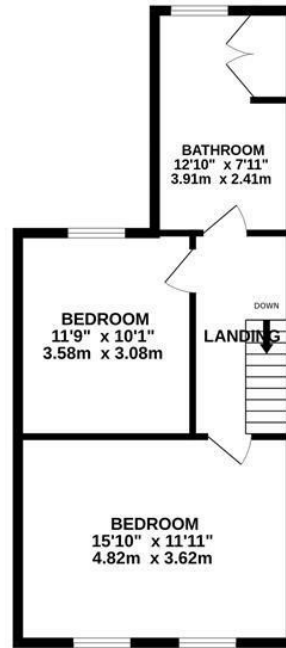
1ST FLOOR 475 sq.ft. (44.1 sq.m.) approx.