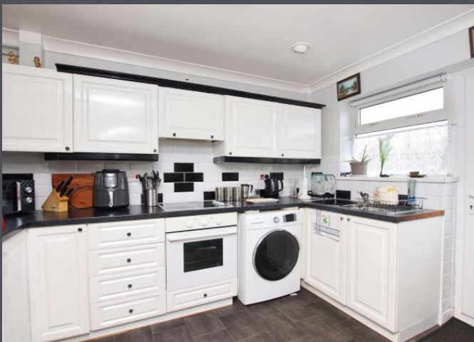
13 Woodland Road, Beddau CF38 2DG