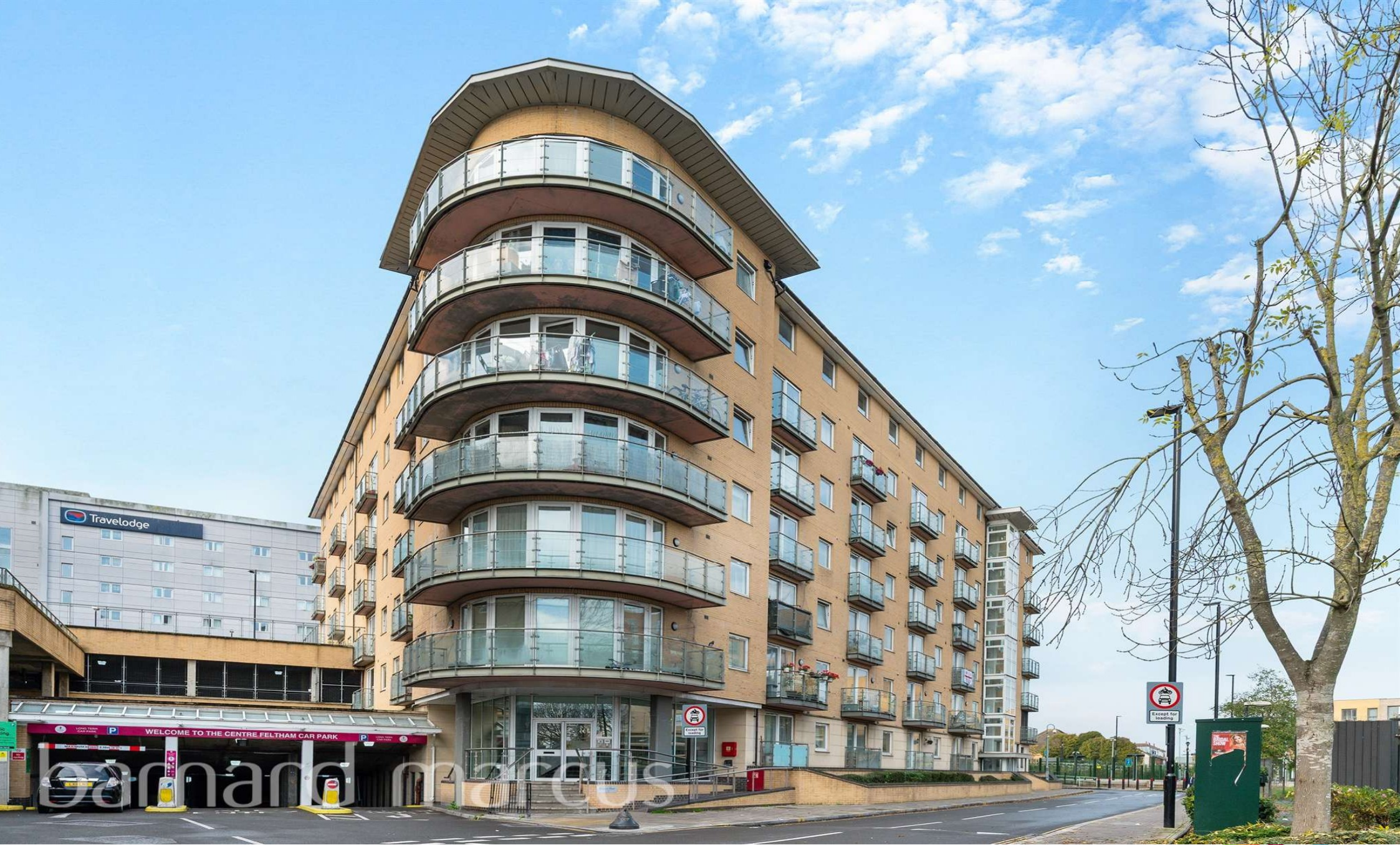
Bergenia House Bedfont Lane, Feltham TW13 4GE