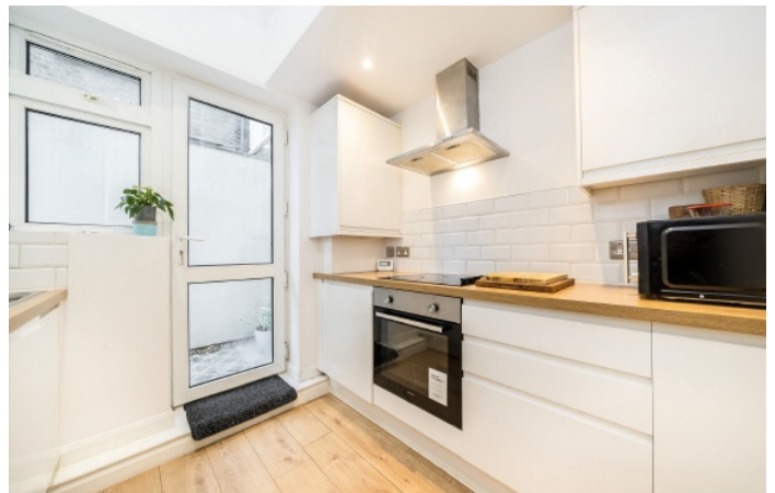
Ommaney Road, SE14