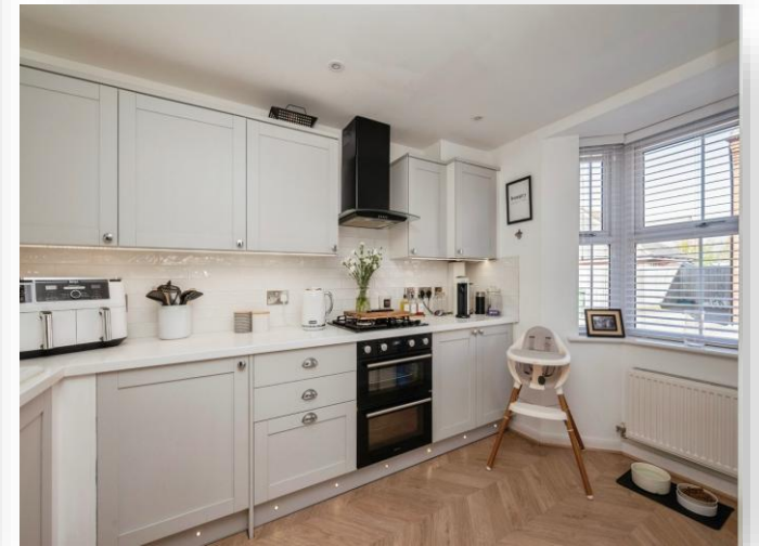
Thomas Way, Horsford, Norwich, NR10 3FQ