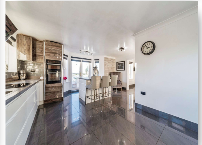
Watson Close, North Clifton Newark NG23 7AL