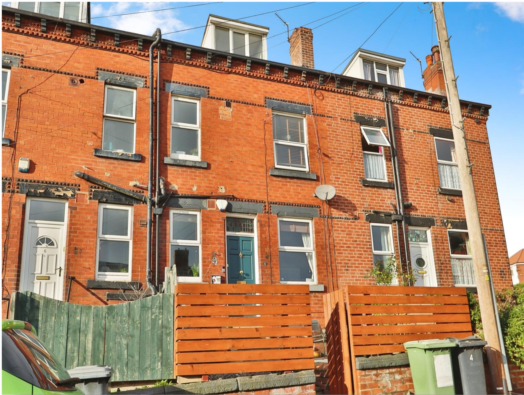
Argie Gardens, Leeds LS4 2JL