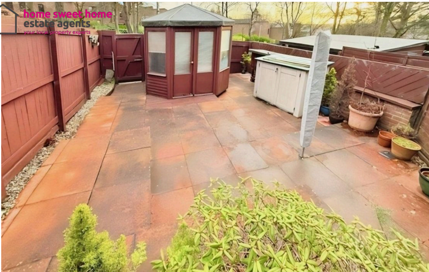
GARDEN front & rear