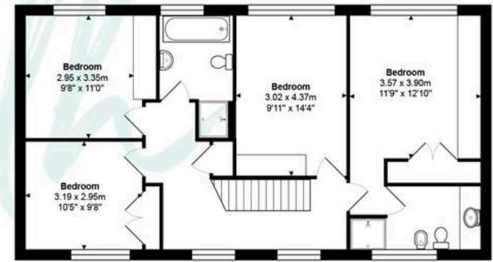
First Floor Area: approx. 78.7 m 2 ... 847 ft 2

Total Area: approx. 281.0 m 2 ... 3024 ft 2 (excluding plant room, swimming pool room)