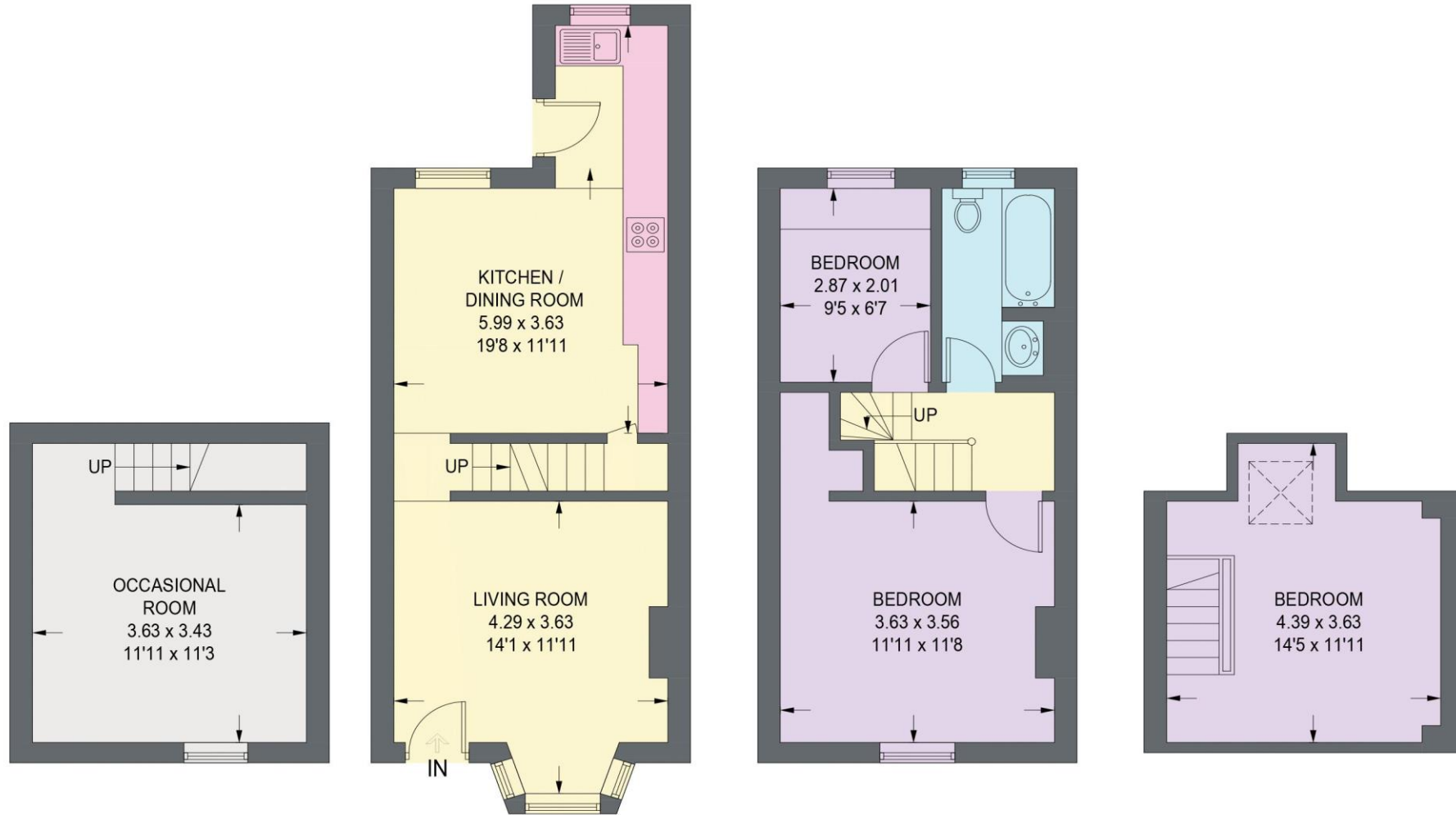
CELLAR 16.1 SQ M / 173 SQ FT