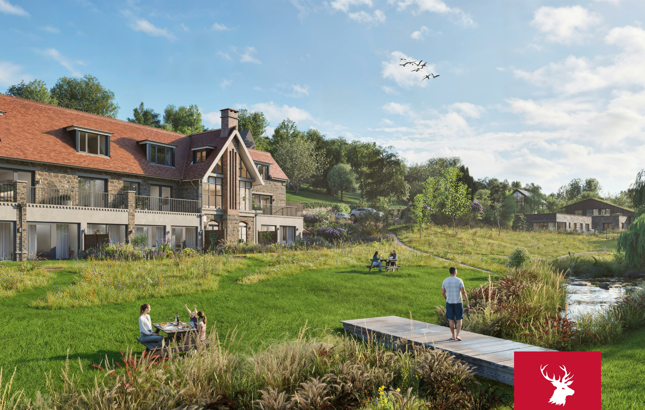
Apartment 6, Lee Bay Gardens