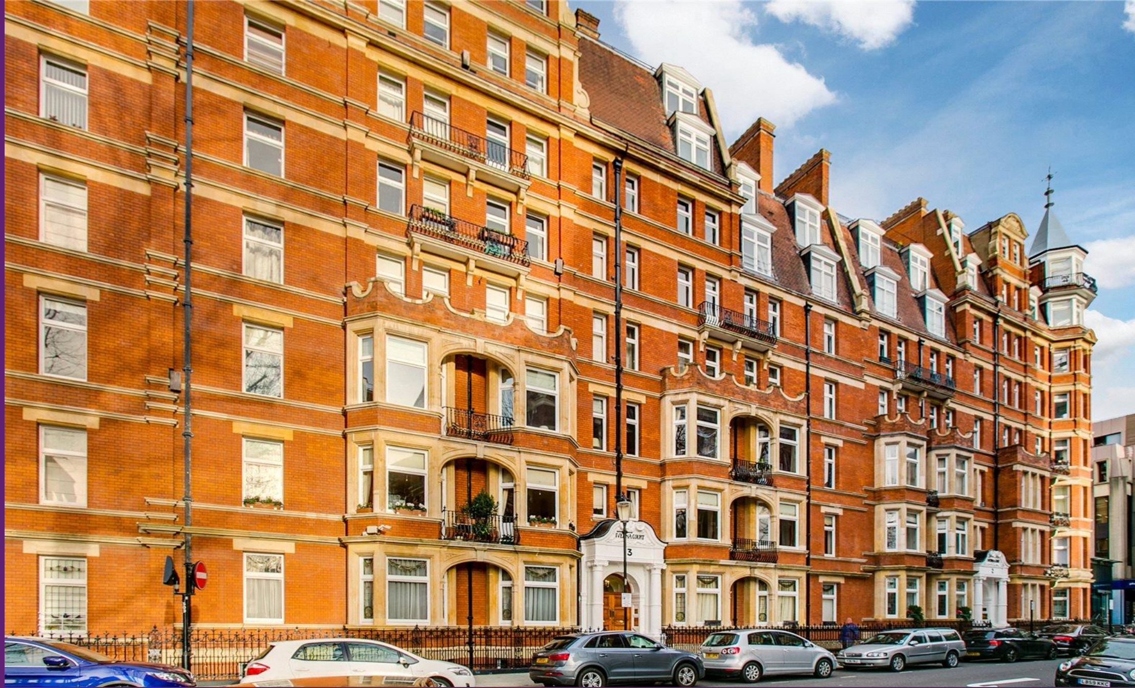
Iverna Court Kensington, W8