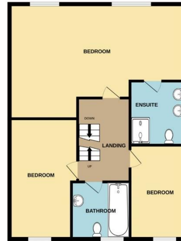
1ST FLOOR 850 sq.ft. (78.9 sq.m.) approx.