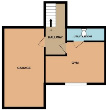
LOWER GROUND FLOOR 425 sq.ft. (39.5 sq.m.) approx.