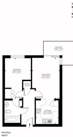
First Floor 490 sq ft

Evan Cook Close, SE15 Approximate Gross Internal Area 45.54 SQ.M / 490 SQ.FT