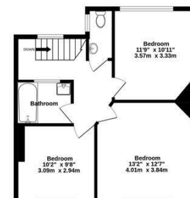
Green Lane, London, SW16

TOTAL FLOOR AREA: 1066 sq.ft. (99.0 sq.m.) approx. Measurements are approximate. Not to scale. Illustrative purposes only. Made with Metropix ©2022.