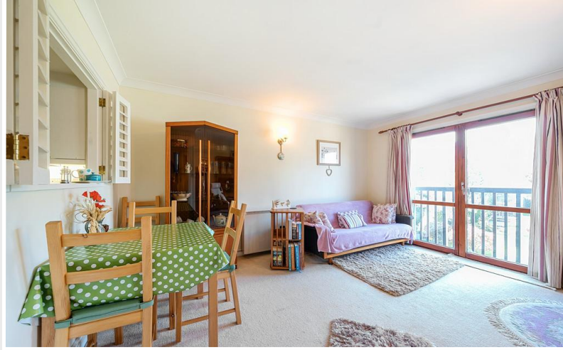
Living/ Dining Room

Anti-Money Laundering Regulations Please note that when an offer is accepted on a property, we must follow government legislation and carry out identification checks on all buyers under the Anti-Money Laundering Regulations (AML). We use a specialist third-party company to carry out these checks at a charge of £60.00 (inc. VAT) per individual or £50.00 (incl. vat) per individual, if more than one person is involved in the purchase (provided all individuals pay in one transaction). The charge is non-refundable, and you will be unable to proceed with the purchase of the property until these checks have been completed. In the event the property is being purchased in the name of a company, the charge will be £150 (incl. vat).