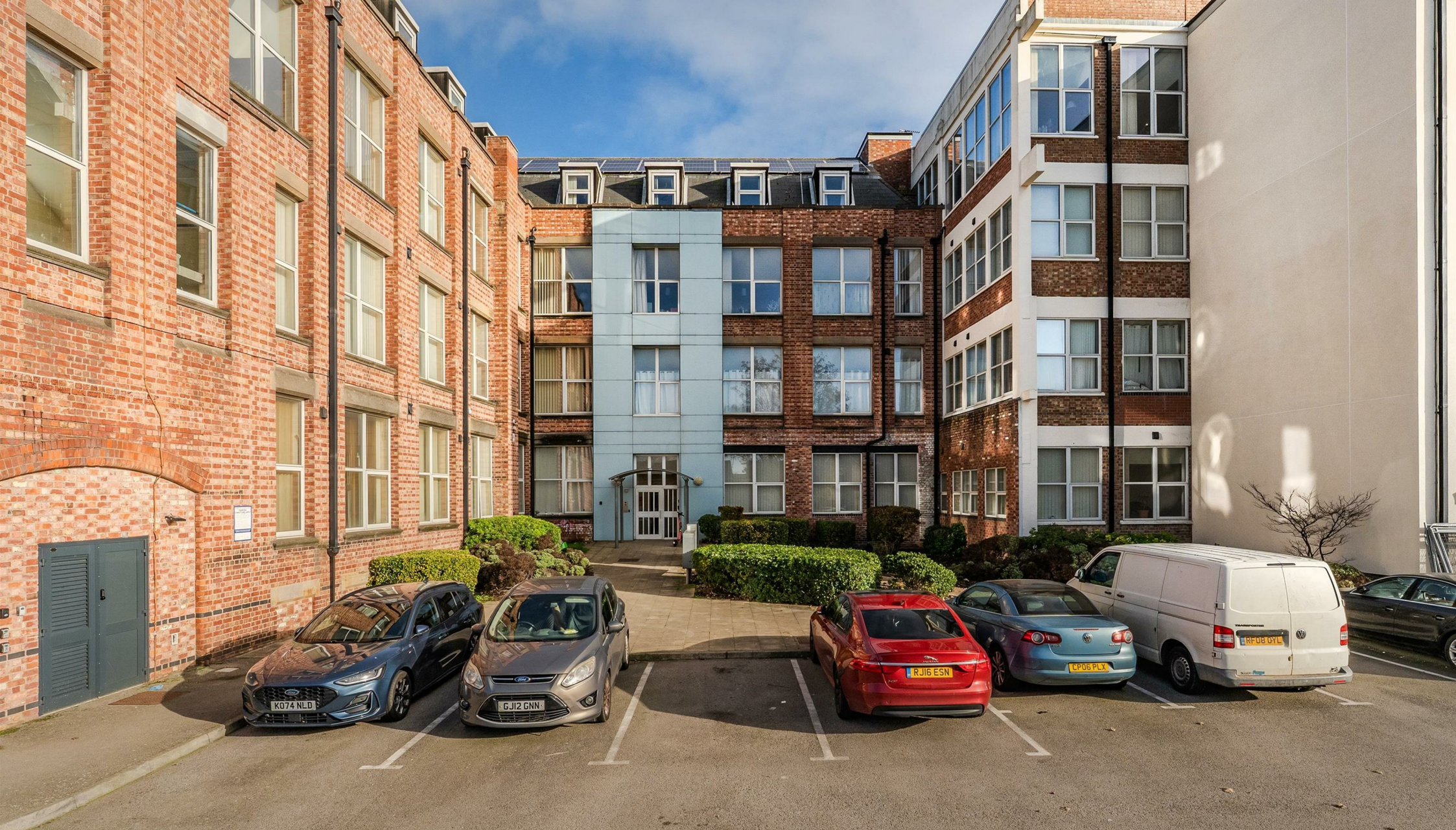
Orient House Cobden Street Kettering, NN16 8DX