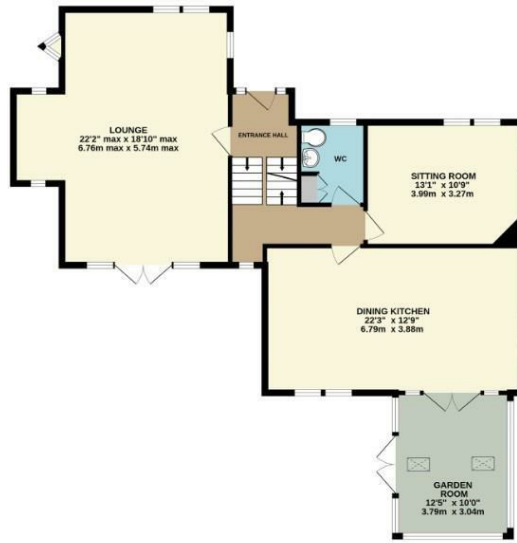
GROUND FLOOR 1055 sq.ft. (98.0 sq.m.) approx.