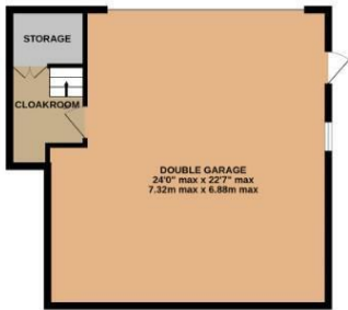
LOWER GROUND FLOOR 560 sq.ft. (52.0 sq.m.) approx.