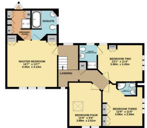
FIRST FLOOR 860 sq.ft. (79.9 sq.m.) approx.