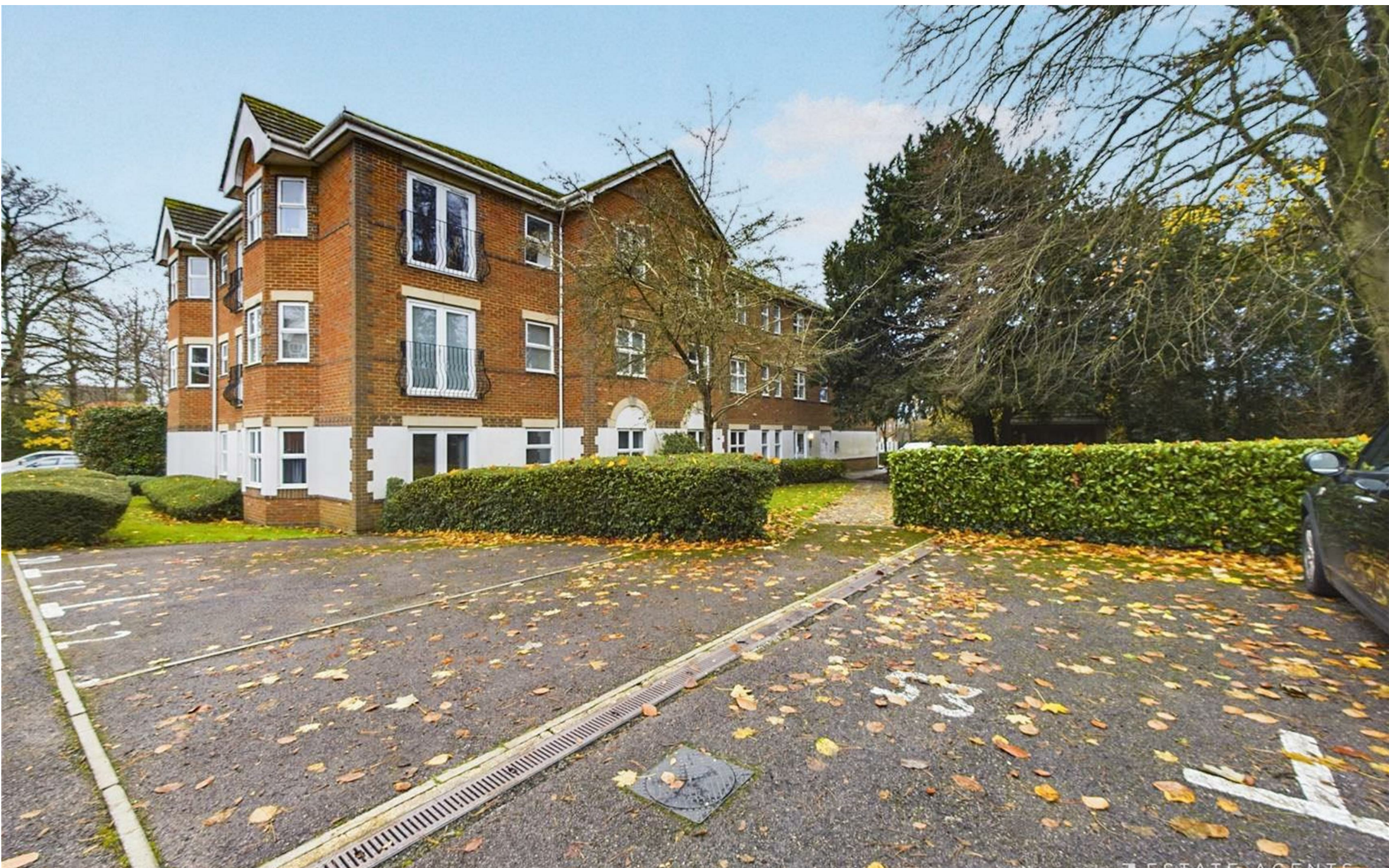
Regent Court, Norn Hill, Basingstoke, RG21 4HP