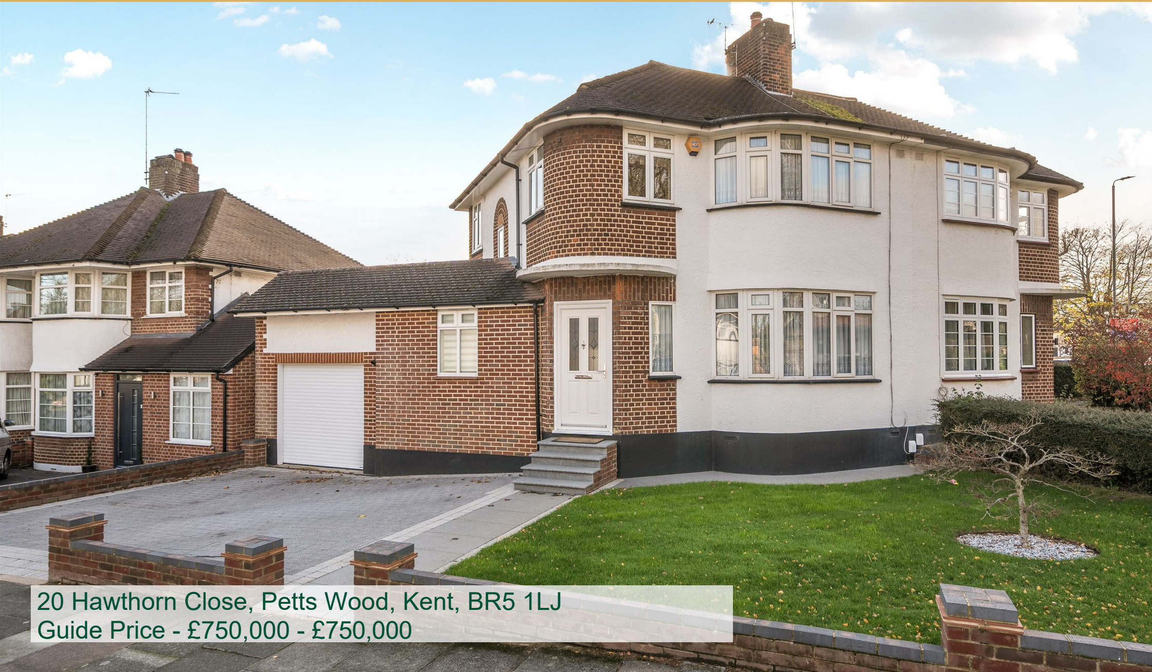
20 Hawthorn Close, Petts Wood, Kent, BR5 1LJ Guide Price - £750,000 - £750,000