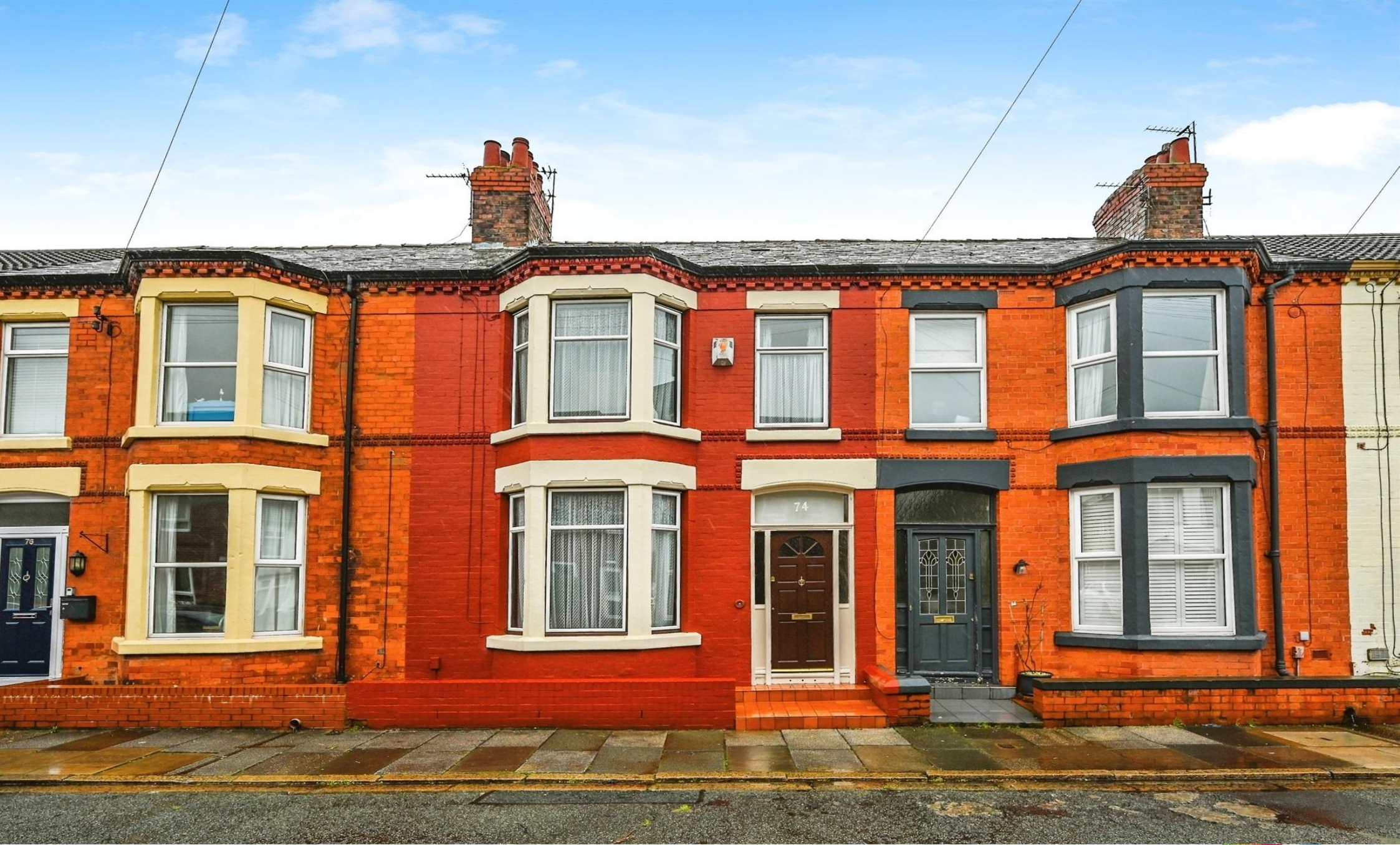
Gorsedale Road, Liverpool L18 5EZ