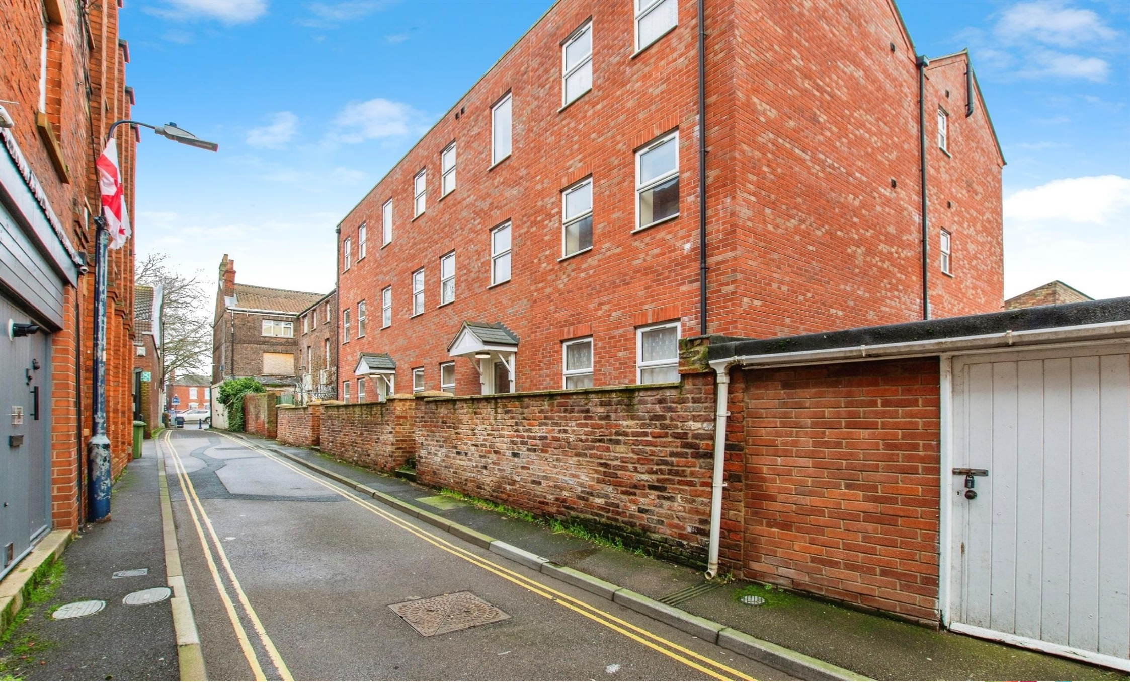
6 Threadneedle Street, Boston PE21 6SP