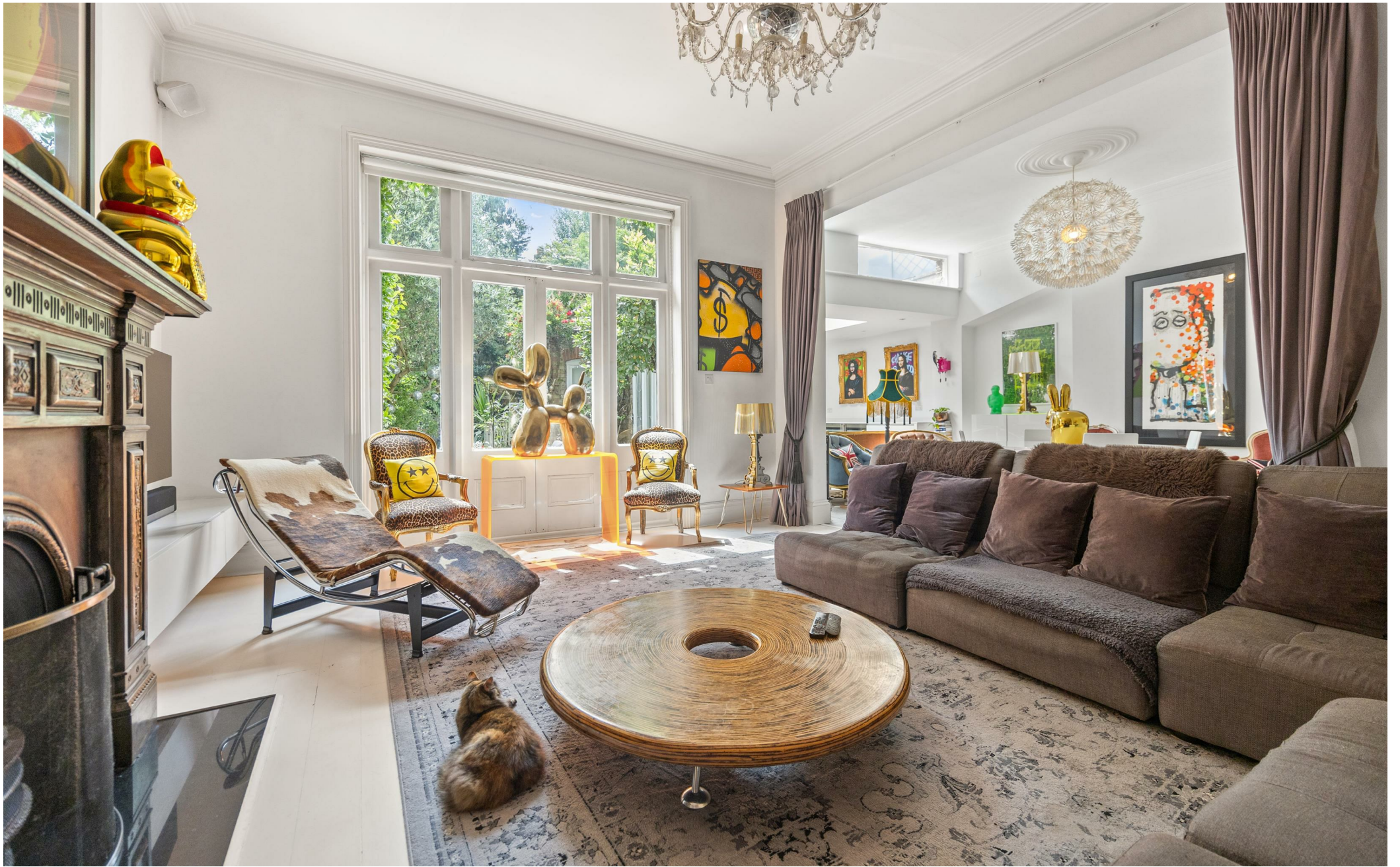
Goldhurst Terrace NW6