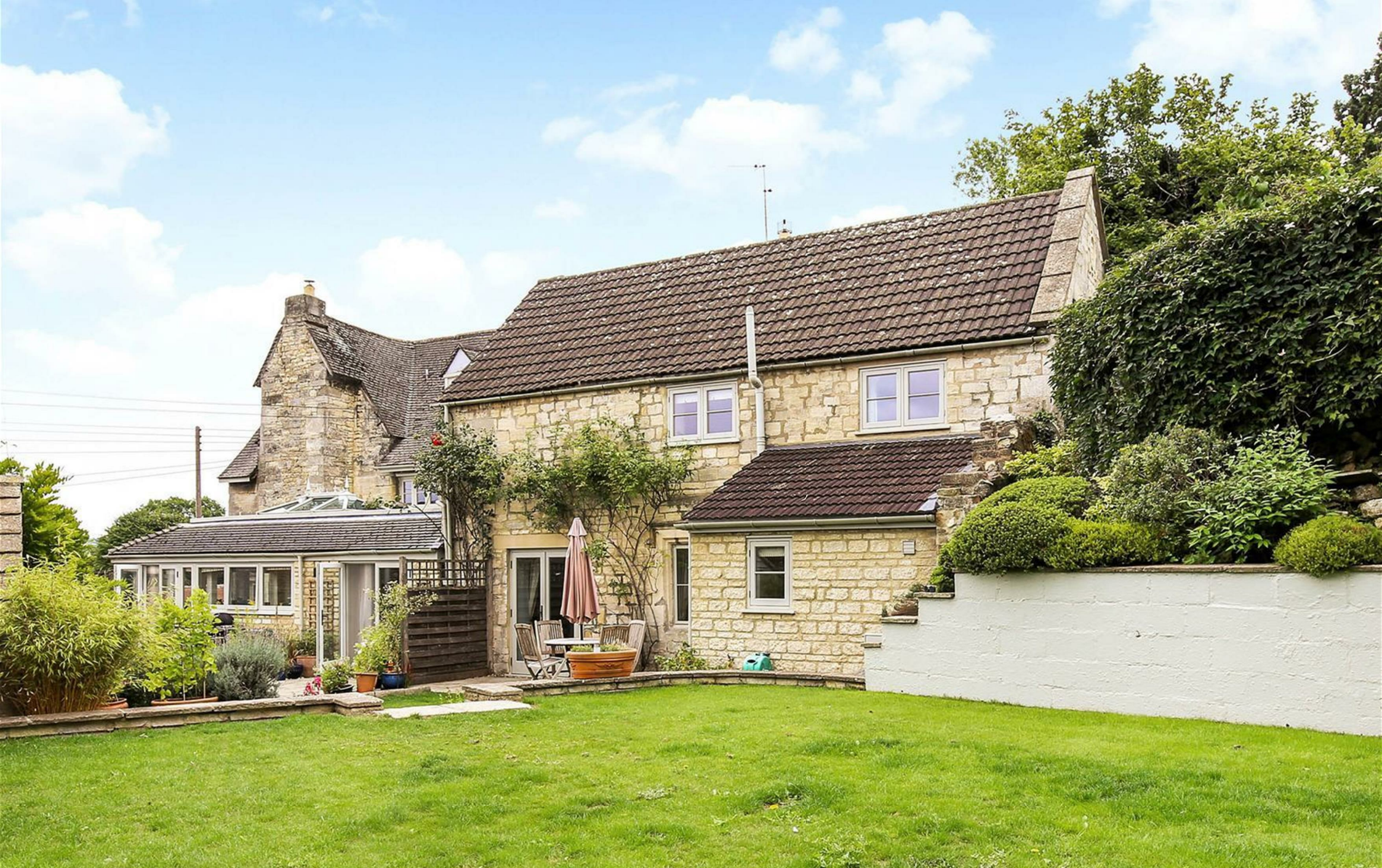
Park Farm Cottage · Park Farm · Selsley West · Stroud