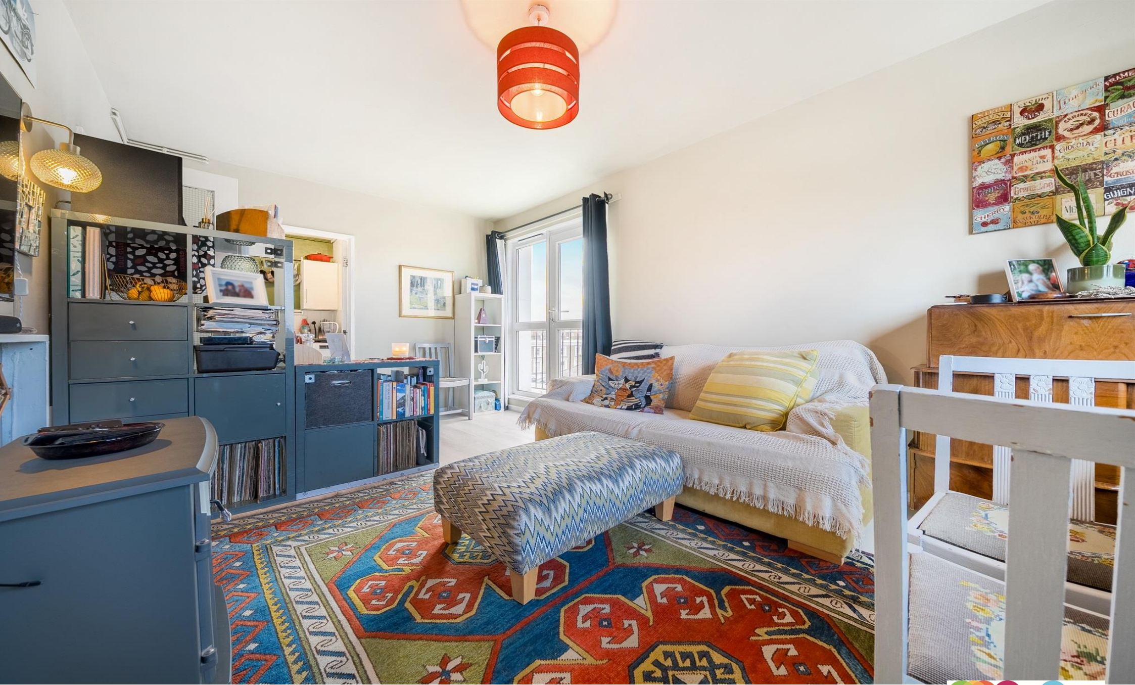
Eglington Court Lorrimore Road, London SE17