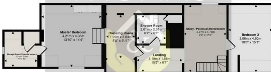
First Floor Approx 81 sq m / 868 sq ft