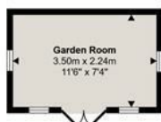
Outbuilding 2 Approx 8 sq m / 85 sq ft