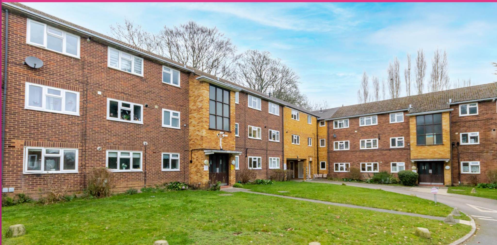
ELLWOOD GARDENS, WATFORD - £300,000 2 Bedroom Flat