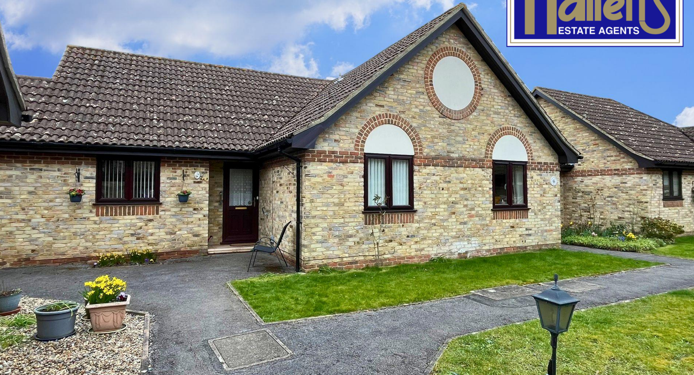
26 The Maltings Thatcham Berkshire RG19 4YB