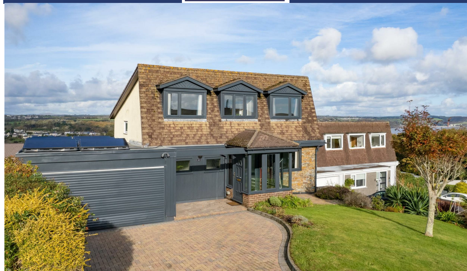
"Golwg Y Mor", 4 Bevelin Hall, Saundersfoot, Pembrokeshire, SA69 9PG