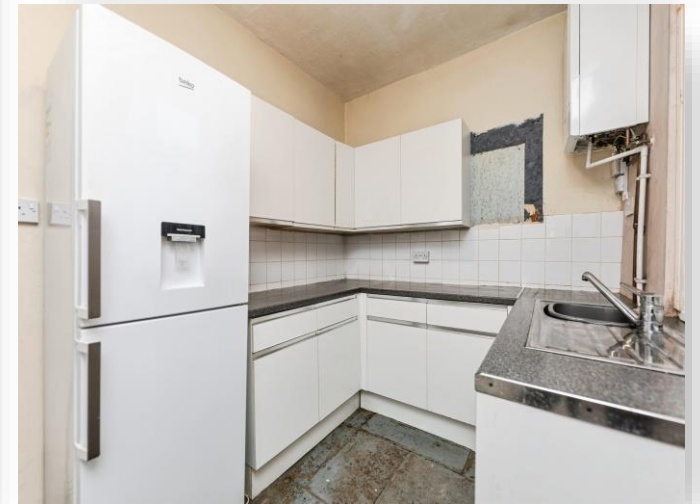
Troy Road, Morley Leeds LS27 8JE