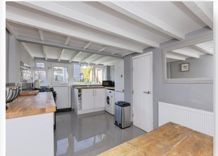
Ratcliffe Road, Thrussington