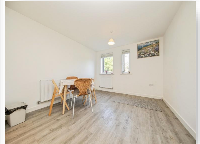
Barcro Square, Colchester, CO1 1FB