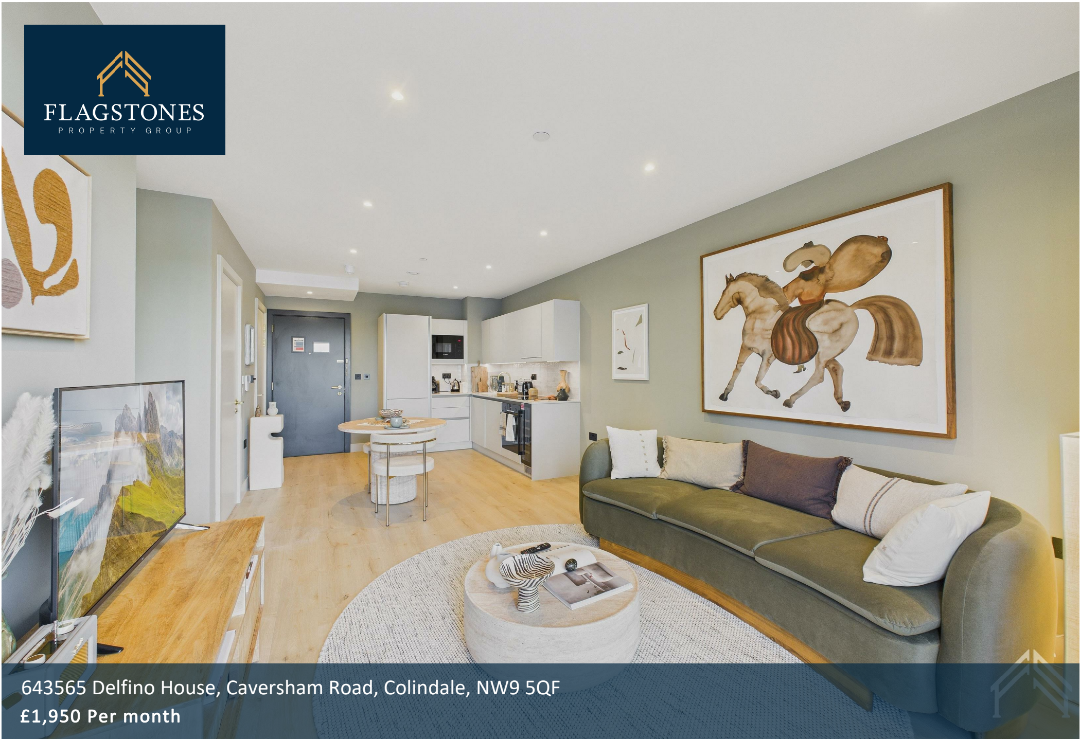
643565 Delfino House, Caversham Road, Colindale, NW9 5QF £1,950 Per month