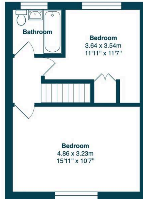
First Floor Area: 33.7 m 2 ... 362 ft 2