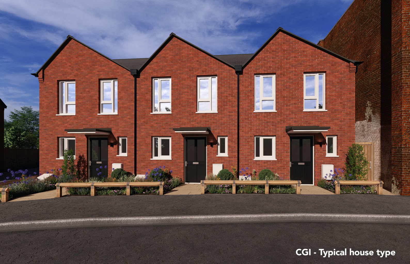
CGI - Typical house type