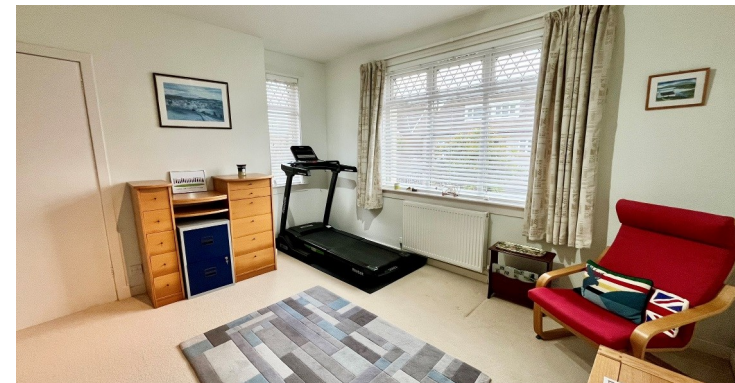
24 Gartcows Crescent