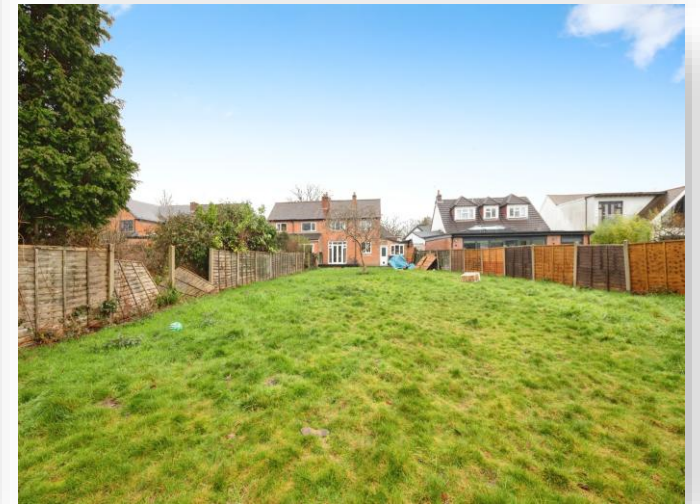
Etwall Road, Birmingham B28 0LF