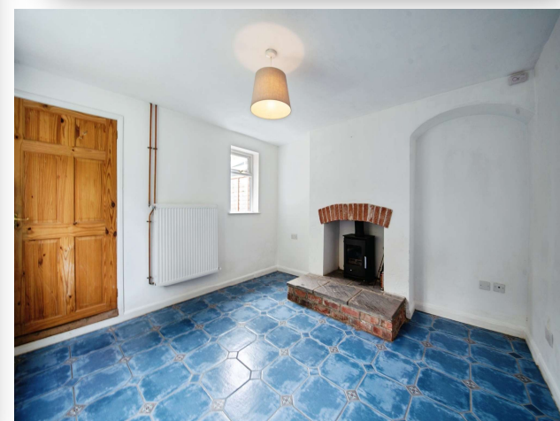
Brooklands Cottage Aveland Way, Aslackby NG34 0HG