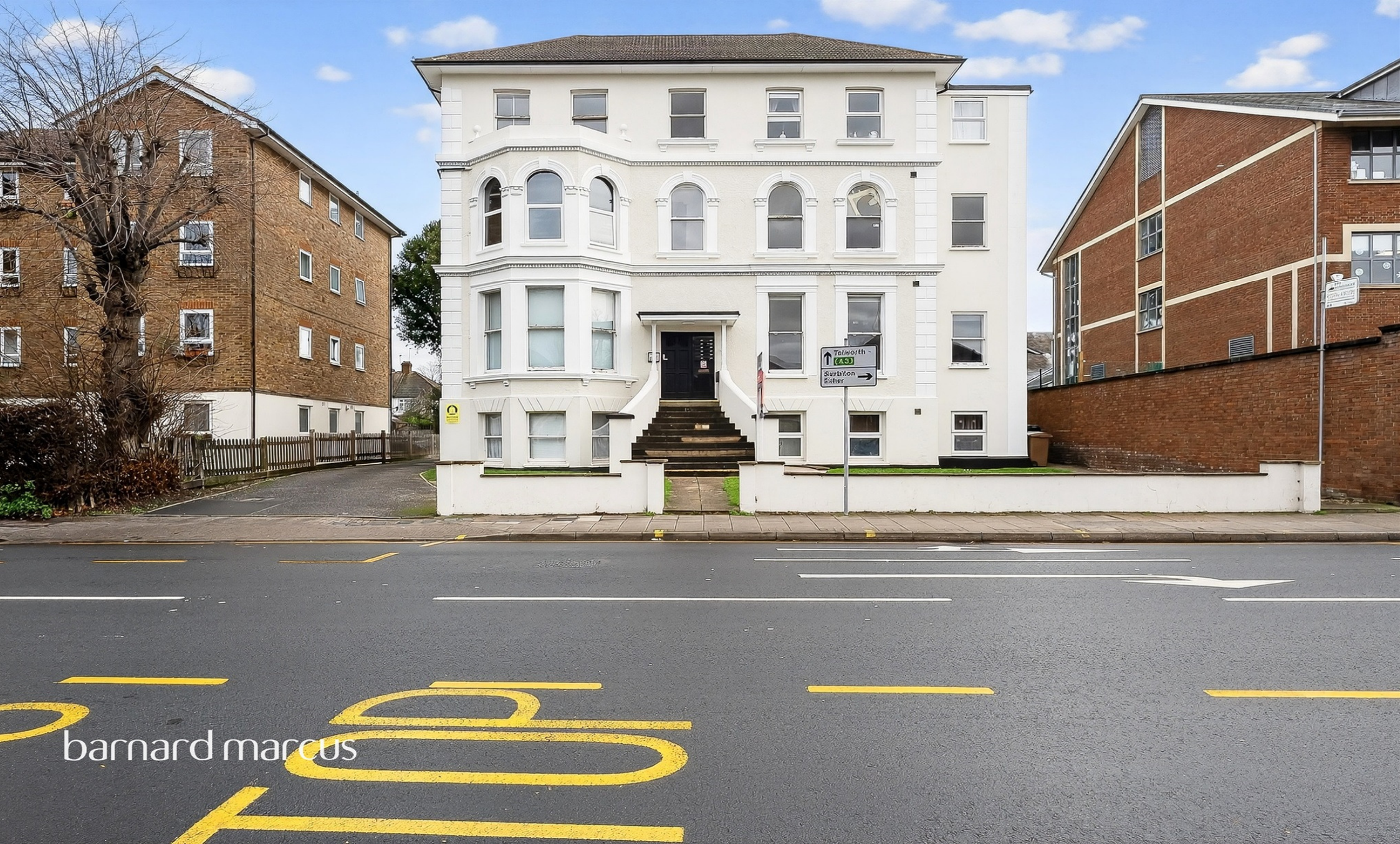
Clyde House, Surbiton Road, Kingston Upon Thames, KT1 2HW