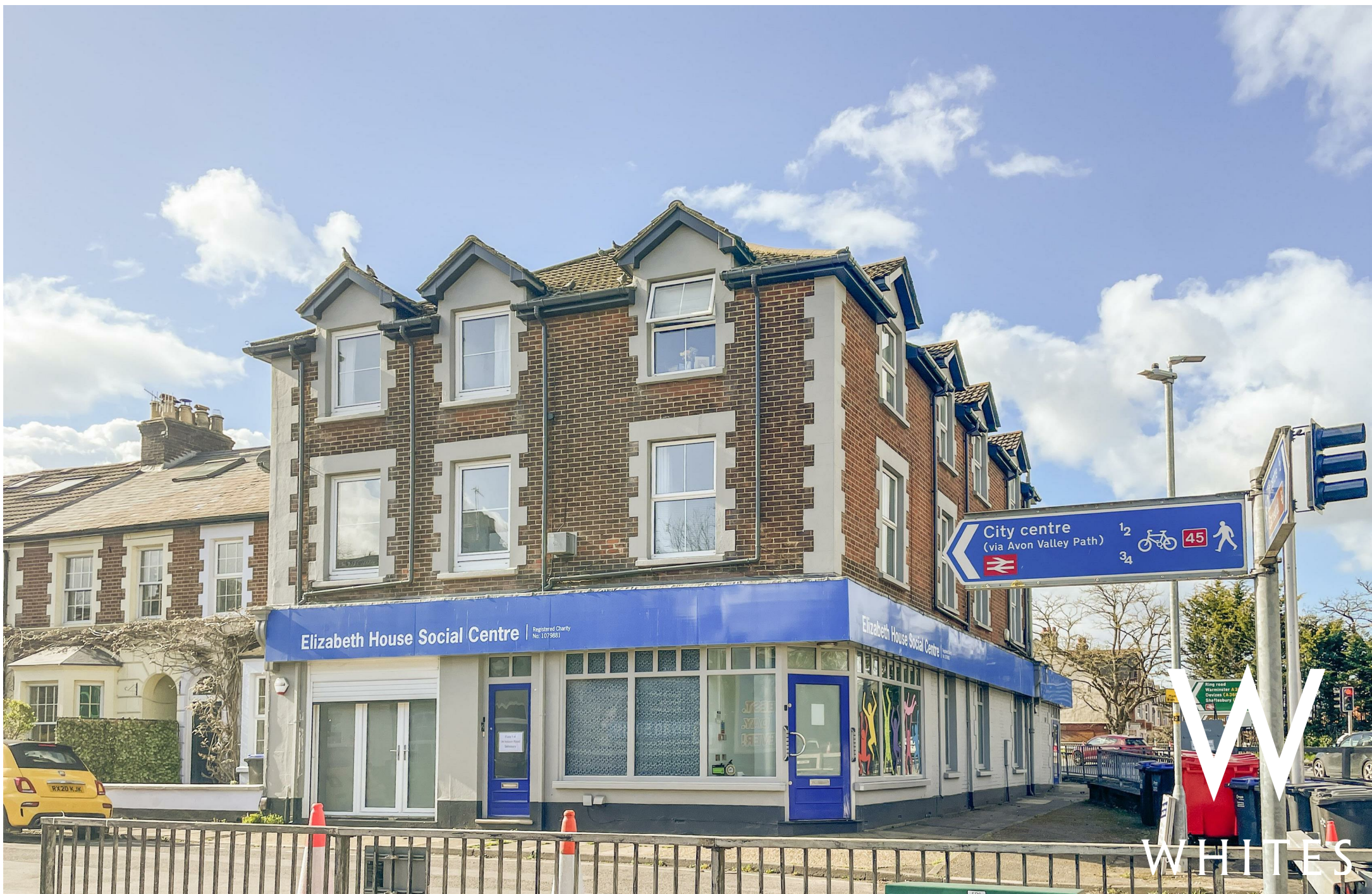
Flat 3, Nelson House 1a Nelson Road, Salisbury, Wiltshire, SP1 3LT