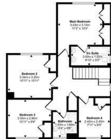
First Floor Approx 67 sq m / 720 sq ft