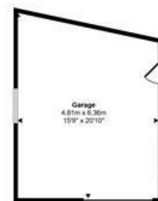
Garage Approx 28 sq m / 303 sq ft

This Reception is only for illustrative purposes and is not to scale. Measurements of rooms, doors, windows, and any items are approximate and no responsibility is taken for any error, omission or mis-statement. Sizes of items such as bathroom suites are representative only and may not look like the real items. Made with Make Snappy 360.