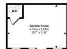
Garden Room Approx 17 sq m / 184 sq ft