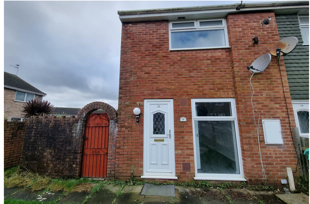
16 Rhos Helyg, Caerphilly, CF83 3QD