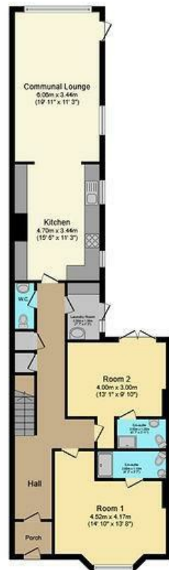
Ground Floor Floor area 99.5 sq.m. (1,071 sq.ft.)