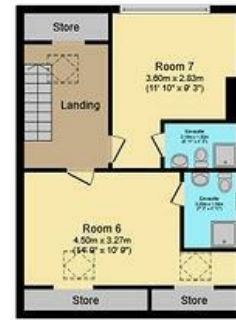
Second Floor Floor area 52.6 sq.m. (567 sq.ft.)

Total floor area: 230.2 sq.m. (2,478 sq.ft.)