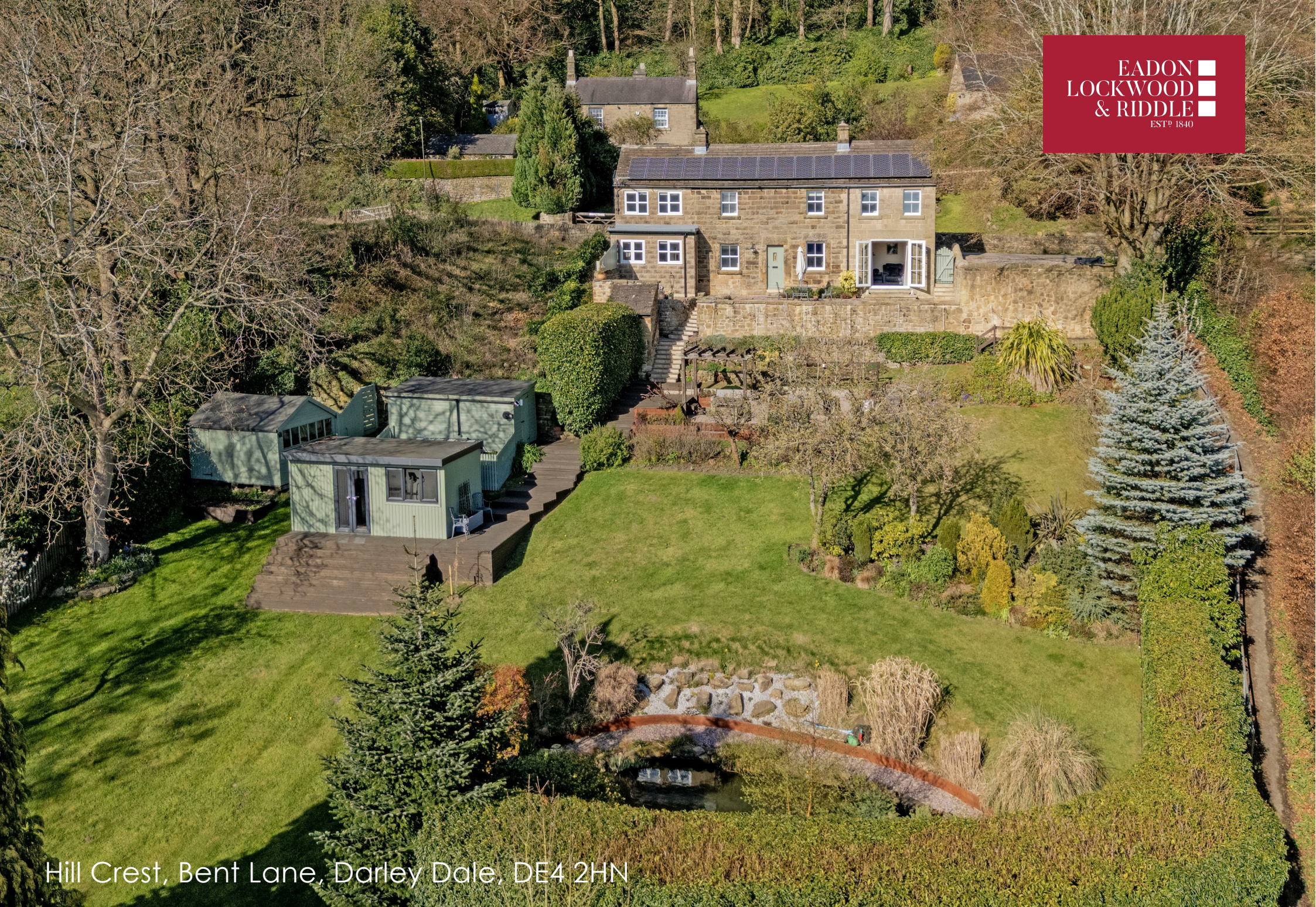
Hill Crest, Bent Lane, Darley Dale, DE4 2HN