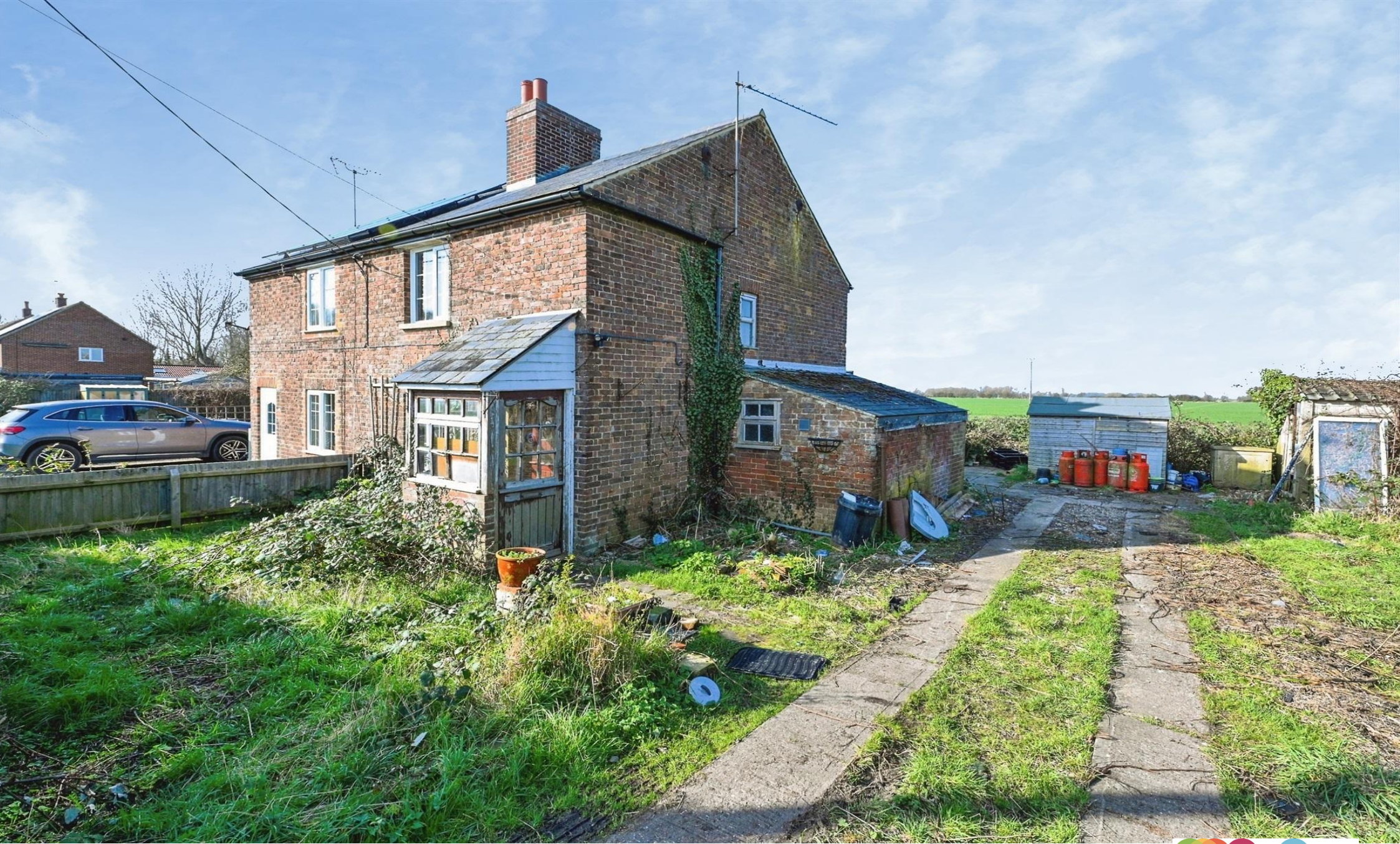
Banklands Cottage, Hall Road, Clenchwarton, King's Lynn, PE34 4DB