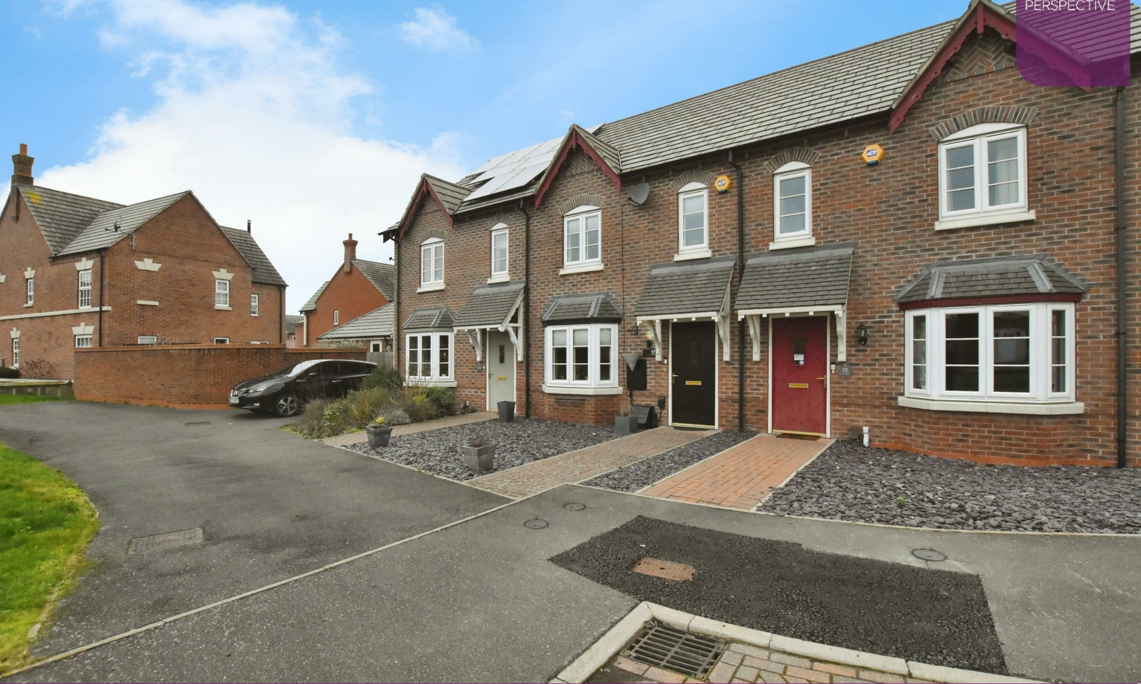
17 Skylark Fields, Nuneaton, CV10 0GE £240,000