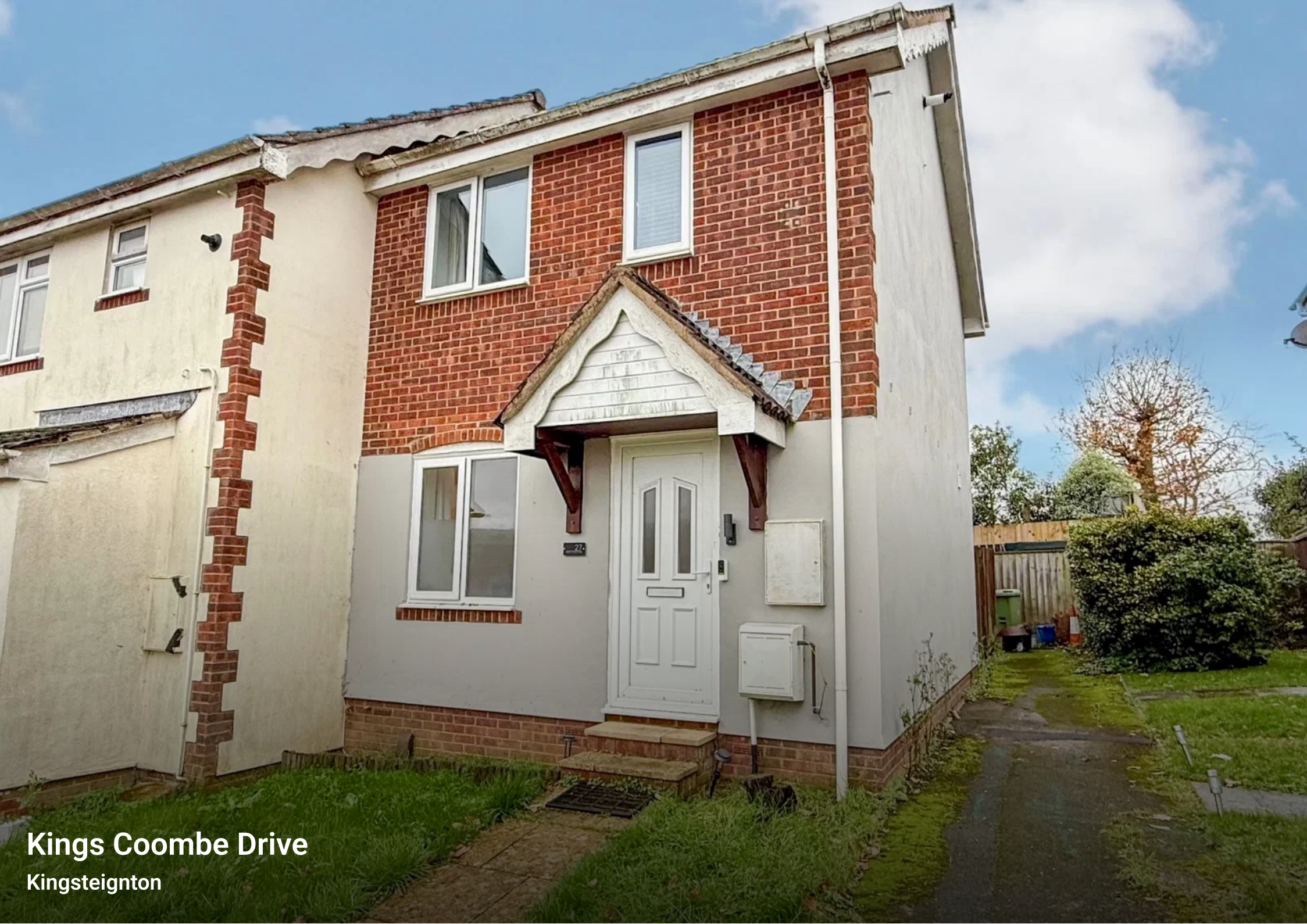
Kings Coombe Drive Kingsteignton